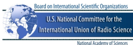
Figure 1. The AP-S logo (top) and the UNSC-URSI logo (bottom).