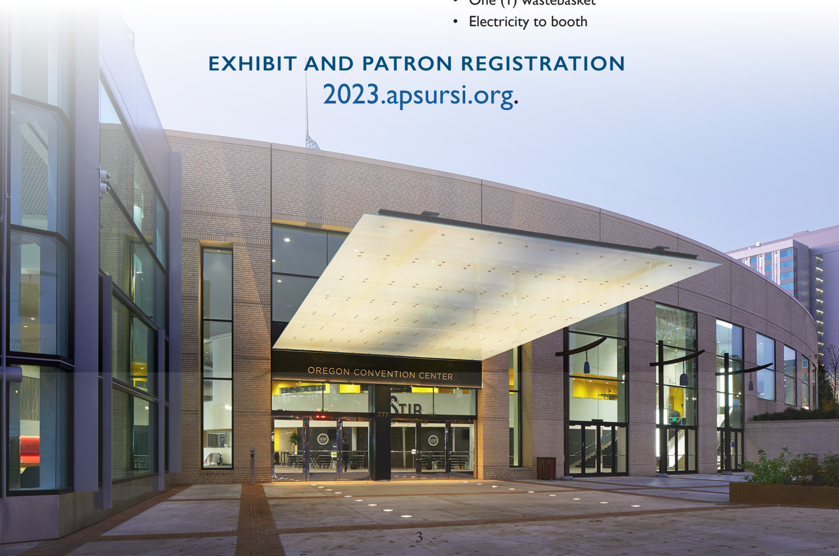
EXHIBIT AND PATRON REGISTRATION 2023.apsursi.org